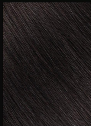
Off Black #1B