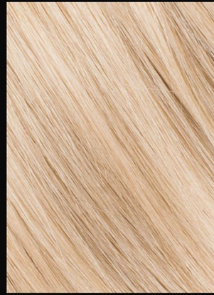
Icy Blonde Balayage #60/22/SV