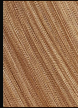
Bronde Balayage #6/27/60