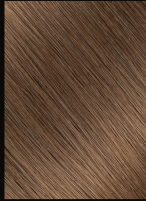
Sandy Blonde #14