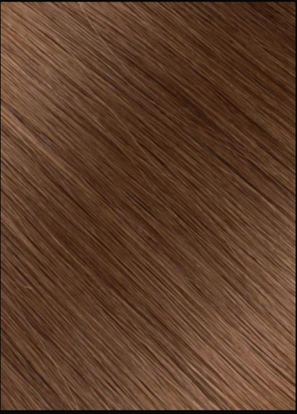
Ash Brown #10