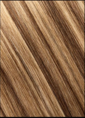
Light Brown Blonde #30