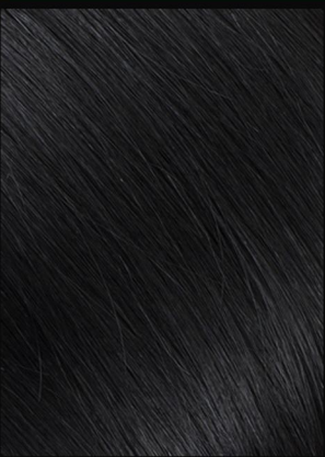
Jet Black #1