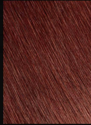
Light Ash Brown #18