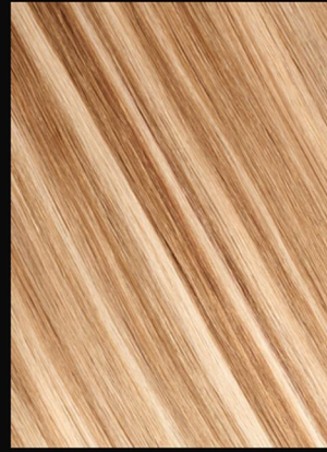
Copper Red #130