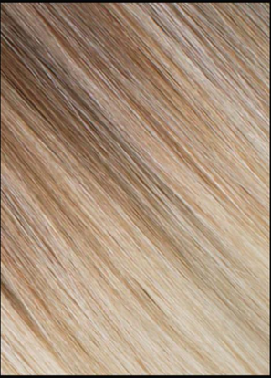
Dark Rooted Blonde #8A