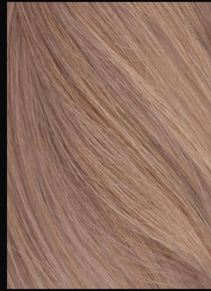
Golden Brown Balayage #4/27/30