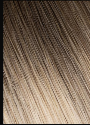
Champagne Blonde #22