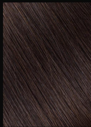
Dark Brown #2