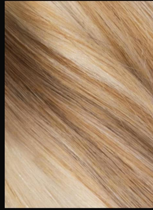
Dirty Blonde #60