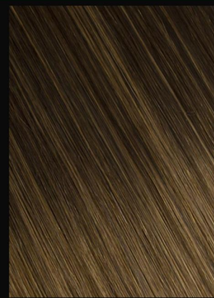
Caramel Brown #6