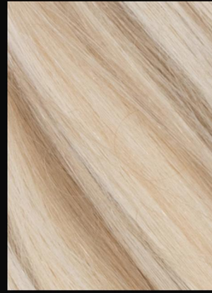
Warm Auburn #38B