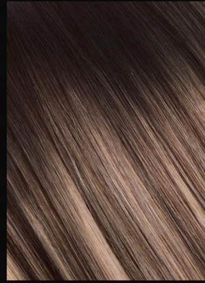
Dark Ash Blonde #17