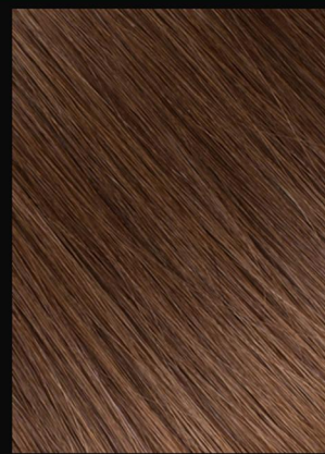
Chocolate Brown #4