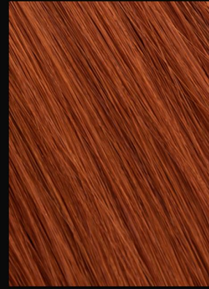
Caramel Highlights #4/30