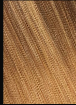
Ash Blonde Highlights #8/60