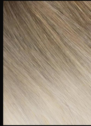
Warm Balayage #6/30/27