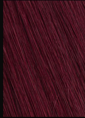
Chestnut Brown #4/27