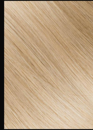
Champagne Balayage #18/22/60