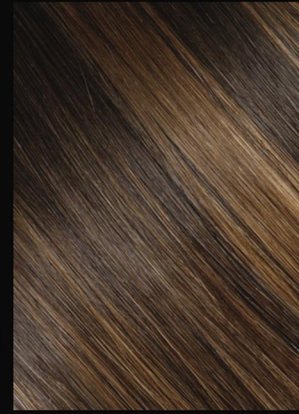
Strawberry Blonde #27