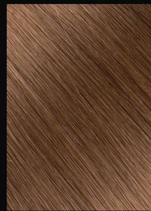
Dark Blonde #8