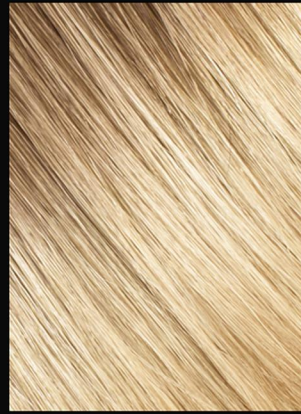
Balayage Brown Blonde #2/6/18