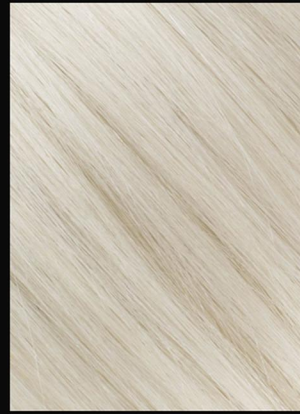
Platinum Blonde #80