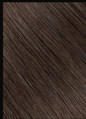
Warm Espresso #3