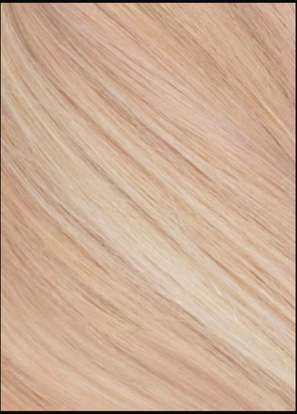
Golden Hour #22/5/60